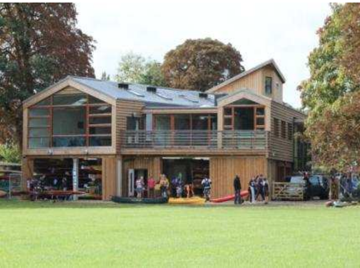
Adventure Dolphin, Pangbourne