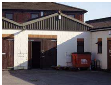
Kennet Enterprise Centre