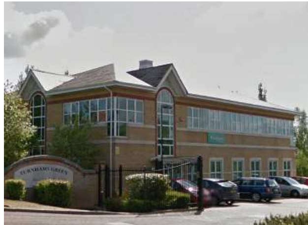
Turnhams Green offices

2.5.1 Operational property is occupied by or on behalf of the Council for the direct delivery of its services, for example Council offices and community schools. Outsourced functions such as sports centres, waste collection and some community care buildings are occupied by organisations providing services on Council's behalf but are still classified as operational property.